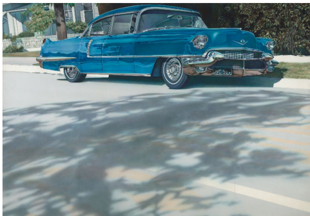
Don Eddy, Blue Caddy , 1971

From 10 February to 9 June 2024, Centraal Museum in Utrecht presents the exhibition In Focus: A Closer Look at Photorealism . The exhibition centres on Centraal Museum's considerable collection of American Photorealism, bringing together the realistic works from the 1970s for the first time in 35 years. The exhibition furthermore presents a number of contemporary variants of Hyperrealism, with a few that were made specially for the exhibition.